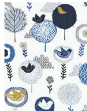
Bird Song Daybreak