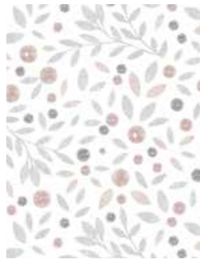
Cotton Flower Blush