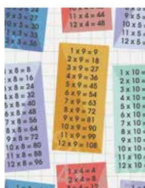
Times Tables Multi