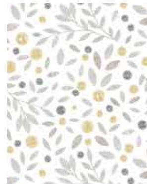
Cotton Flower Ochre