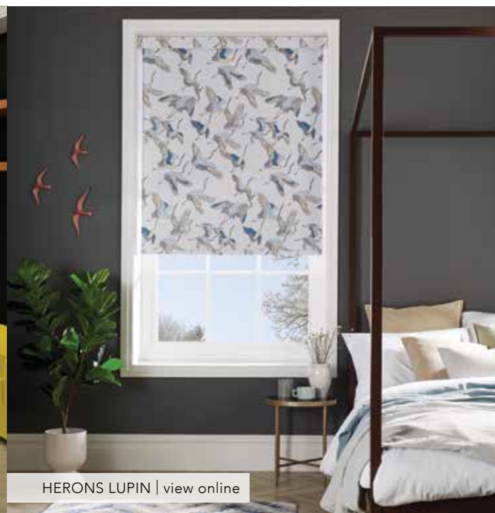
HERONS LUPIN | view online