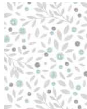
Cotton Flower Mineral