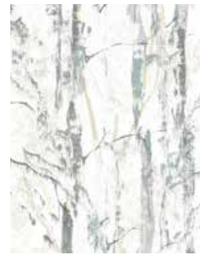
Swedish Birch Silver