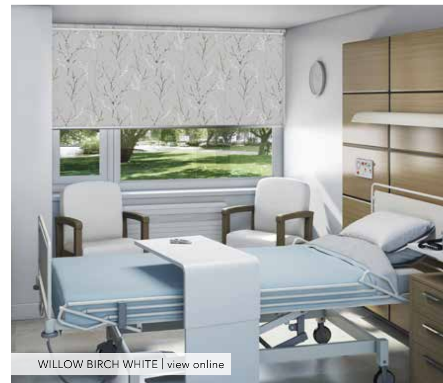
WILLOW BIRCH WHITE | view online