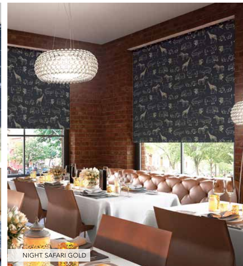
NIGHT SAFARI GOLD