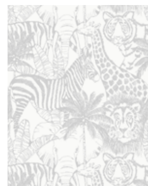
Wild Thing Safari