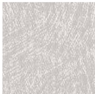
ROMANY LIGHT GREY

2m 1079928A 89mm 1079928D 127mm 1079928B