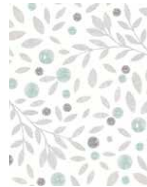
Cotton Flower Mineral