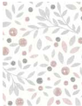
Cotton Flower Blush