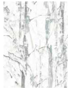
Swedish Birch Silver