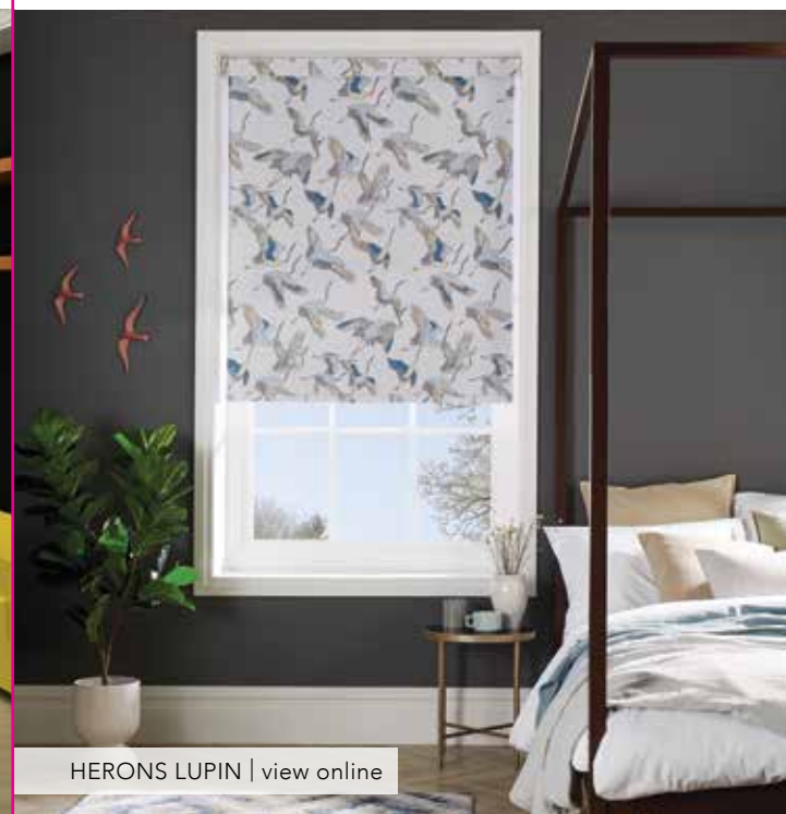
HERONS LUPIN | view online

View all 42 flame retardant prints or download the pdf card from www.louvolitecommercial.com