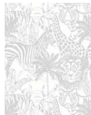
Wild Thing Safari