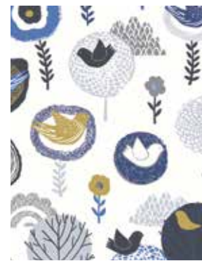
Bird Song Daybreak