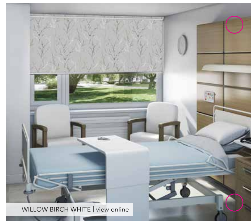
WILLOW BIRCH WHITE | view online