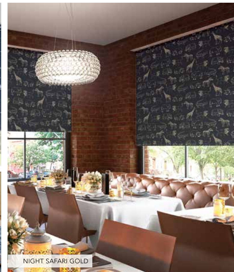
NIGHT SAFARI GOLD