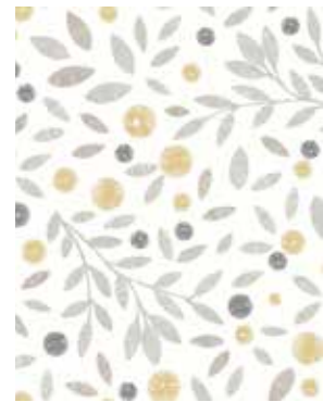
Cotton Flower Ochre