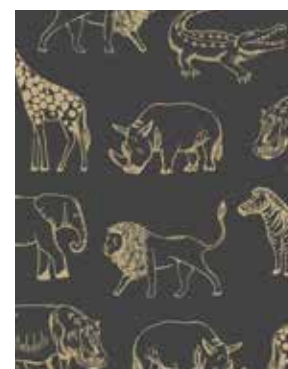
Night Safari Gold